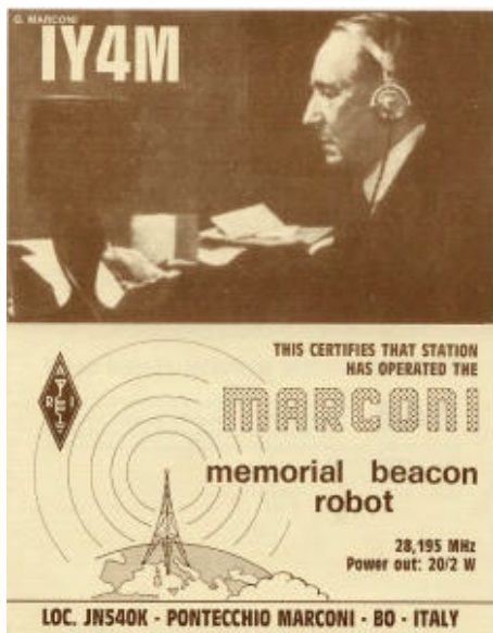
This QSL is from IY4M the beacon/robot from the Associazione Radioamatori Italiani commemorating Guglielmo Marconi's beginning of radio in Bologna, Italy.

"The rig is a home-brew right out of QST magazine, March 2000, with a couple of modifications, mainly a little CPU fan to cool the finals. It puts out a faithful 3.85 watts into an AR-10 vertical antenna at about 40 feet on the roof of my work QTH (WDSE-TV Public Broadcast Studio). The rig was fun to build and I think it sounds pretty good ... The beacon has been on the air since December 1, 2001. When the band is up ... I have received reports from California