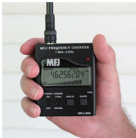
The MFJ-886 in action, showing the 10 digit frequency display and the LCD bargraph at full deflection.

With the ease of hiding wireless security cameras and especially wireless microphones and surreptitious listening devices, those who are