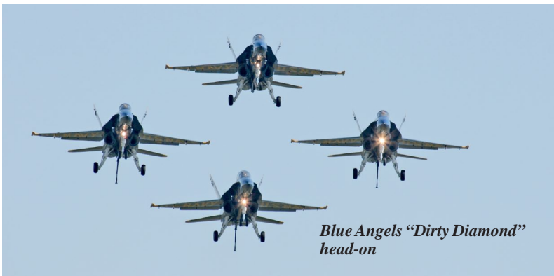
Blue Angels "Dirty Diamond" head-on