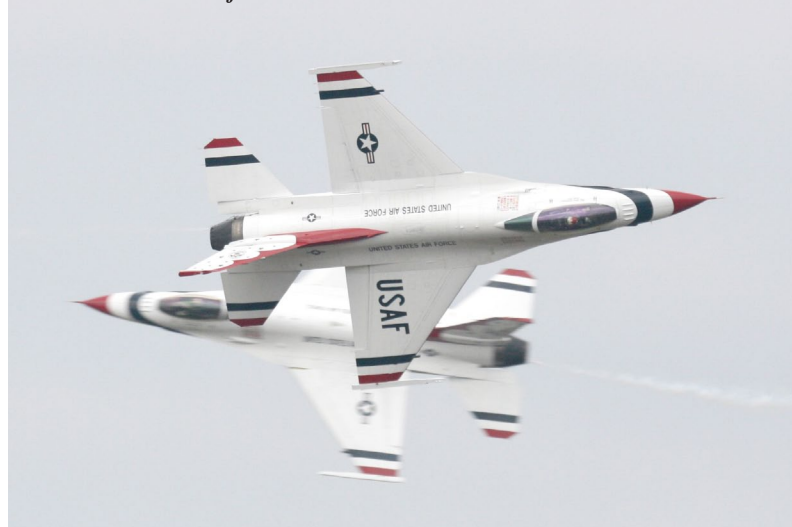
Thunderbirds "Knife Cross"