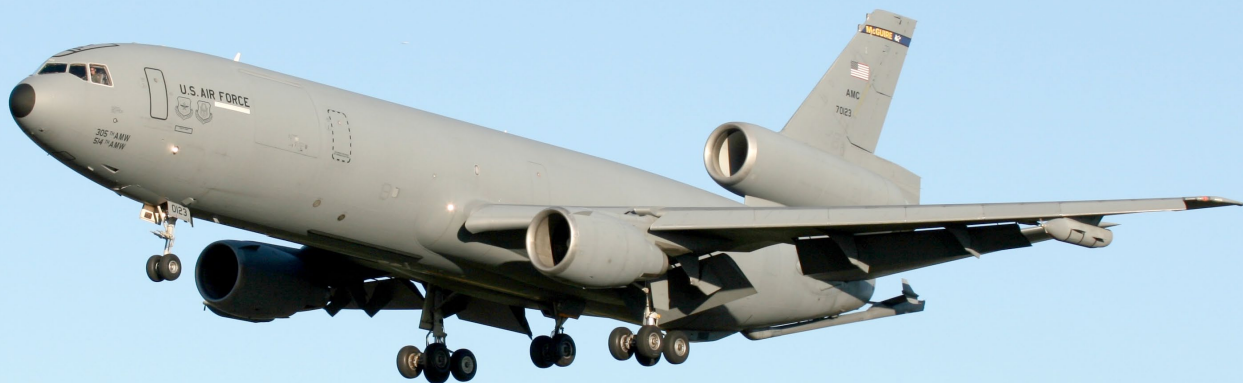
KC-10 on arrival day at the air show

The Horseman P-51 Aerobatic Team 122.925 136.675 The Patriots (L39) Jet Team 127.300 The Red Star Formation 127.050 (Pease Air Show) Tora Tora Tora Warbirds Team (Commemorative Air Force) 122.850 122.875 123.150 123.425 123.450 469.500 (NBFM) 469.550 (NBFM) Vintage Thunderbird (T-33) Aerobatics (Fowler Cary) 123.150 Yakovlevs Team (UK) 124.450 130.900