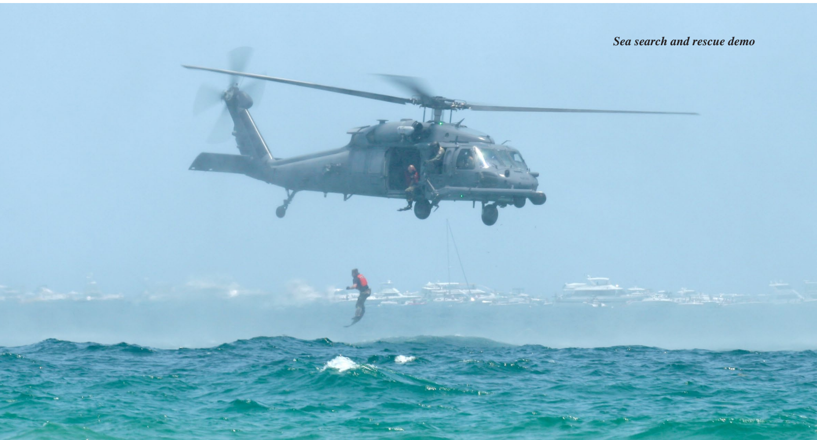
Sea search and rescue demo